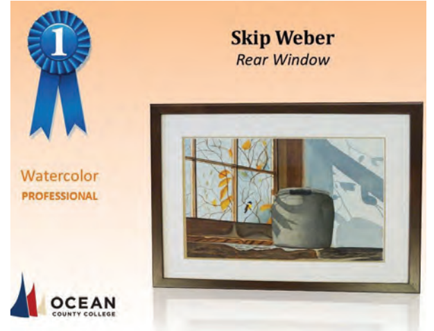
Skip Weber painting