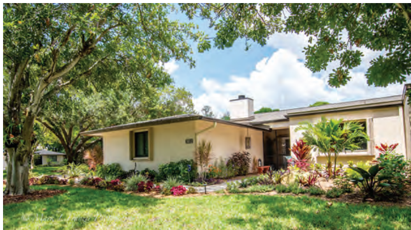
5872 Wild Olive Drive

A very special recognition goes out to the Wyldewood Lakes Landscaping Committee for your volunteered efforts in creating a wonderful entry into that area you call "home." Your individual efforts are appreciated for the beauty that you maintain!